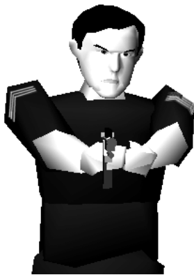
Figure 3: Angry Facial Expression

In this simulation, the virtual human agents have one of two personalities; hostile or non-hostile. Currently, the trainees are all non-hostile. Drivers are randomly chosen to be hostile or non-hostile as they enter the scene and their hostility can be changed at any time during the simulation. The personality of the driver is expressed through his actions. For example, a hostile driver is far more likely to be uncooperative and may even attempt to shoot one of the trainees.